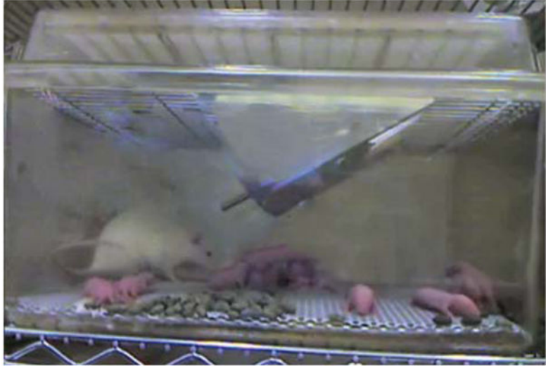
FIGURE 2. Photograph of a cage at the moment of onset of the limited bedding/nesting chronic early-life stress paradigm in rats. Note the fine, plastic-coated aluminium-mesh floor and the shredded paper towel. The cage is placed on a metal cart.